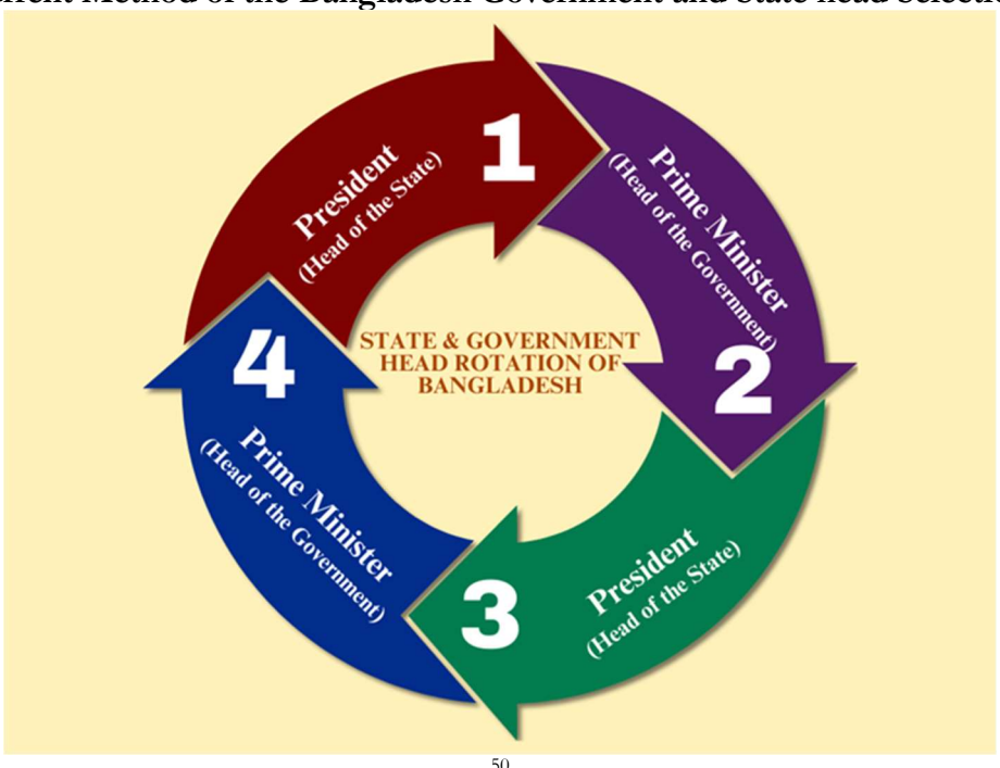
Figure Number: One Current Method of the Bangladesh Government and State head Selection:

Recently, the appointment of Bangladesh's state and governmental head has been controversial due to the perceived impracticality of the rotation system implemented. As illustrated in the chart, the rotation system has faced criticism and concern from various stakeholders. The system's transparency, fairness, and effectiveness have been questioned,