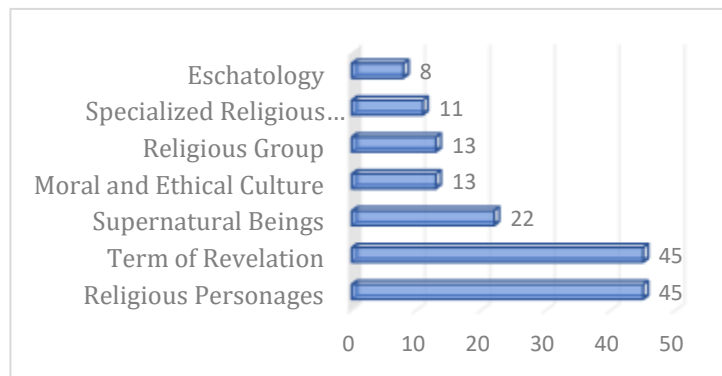
Table 1. Findings of Religious Terminology Terms in Friday Sermons