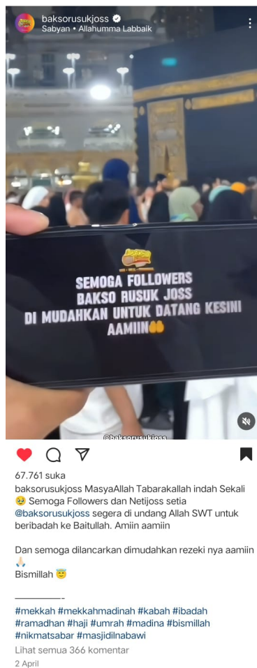
Picture 1. Media Promosi

Explained by Madjid in the book Perjalanan Religius Umrah Dan Haji , that personal affairs are only half true because personal affairs cannot be entered by the interests of others but when each individual does good deeds is part of the consequential aspect of faith, so it is easy to enter the social area. 31 In fact, due to technological advances and the rapid development of social media, it is used as a medium to disseminate all news both in writing