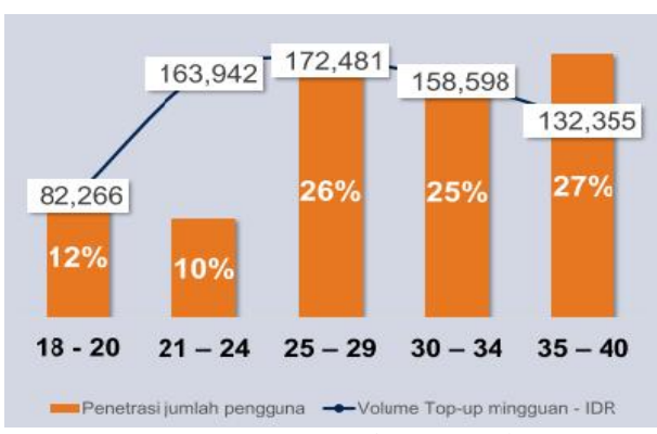
Figure 4. E-Wallet Users By Age

The development of e-wallet in Indonesia cannot be separated from the use of e-wallet which the majority of e-wallet users are young people, namely; millennials and gen Z. The majority of users are 25-29 years old and 35-40 years old (Ipsos, 2020). (see figure 5). The first time users know e-wallet for digital payment transactions is through the information of friends, co-workers, relatives (Ipsos, 2020). E-wallet users choose to use e-wallet due to various factors; the dominating factor is the convenience, promo, and safety factor (can be seen in the graph in Figure 6).