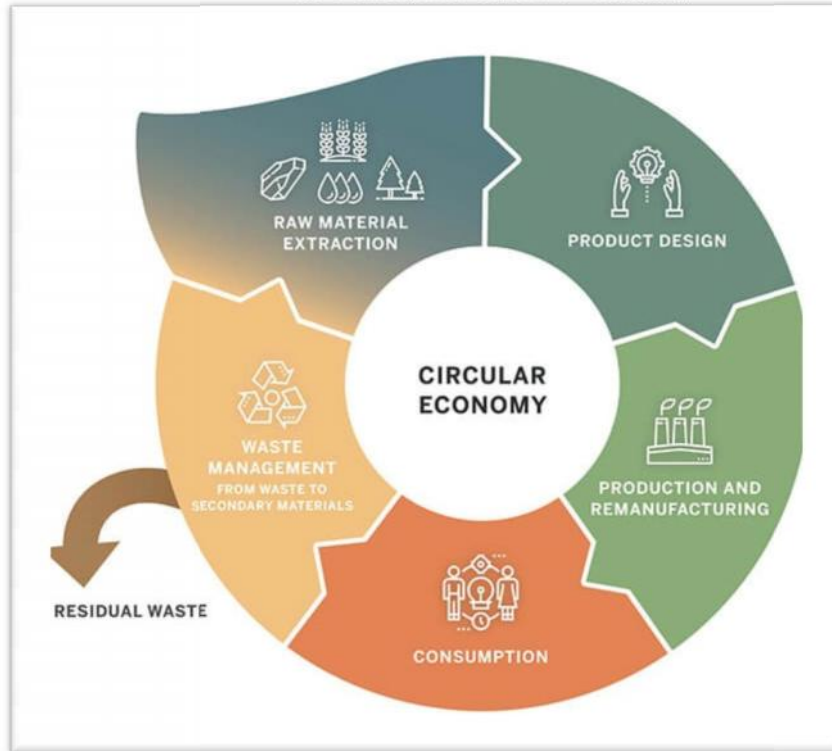
Figure 1 The Concept of Circular Economy