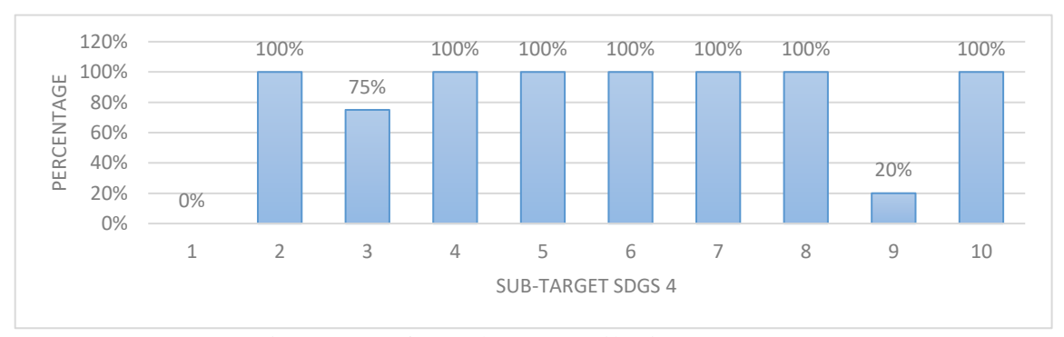
Figure 3. Hayfa Academy Contribution to SDGs 4

Hayfa Academy can contribute to achieving SDG 4, especially in sub-target 4, namely increasing the number of people with skills to achieve financial success. However, in reality, Hayfa Academy also contributes to other sub-targets of SDG 4 with the following details: