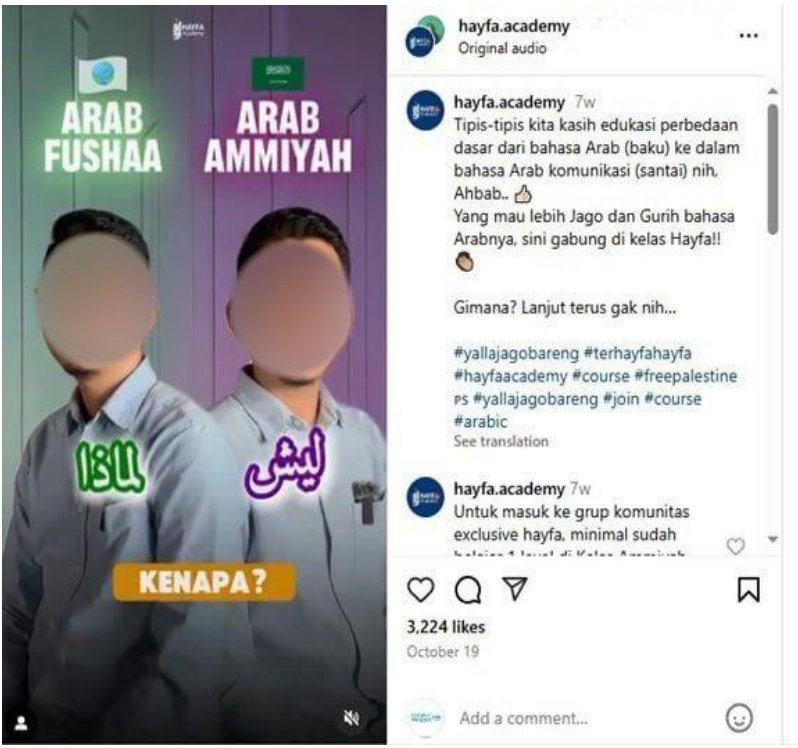
Figure 4. Arabic Learning Content @hayfa.academy<sup>33</sup>

Moreover, the content frequently engages contemporary topics, discussing recent events or issues of relevance in Arabic. For instance, posts have highlighted discussions around the Indonesian football match against Saudi Arabia and other events in Arab countries, using these as relatable contexts to present new vocabulary or grammatical structures. Such content makes the material more engaging and connects learners to real-world applications of the Arabic language, fostering linguistic and cultural understanding.